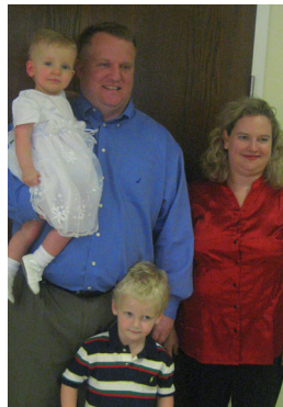
The Sacrament of Holy Baptism