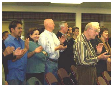
Members of Nueva Vida, the Hispanic Council and Spring Valley celebrate Feliz Navidad together! Over 120 people attended this service.

Our leaders and all of our members look forward to a new year of growth in number, knowledge and grace. Please keep us in your prayers.