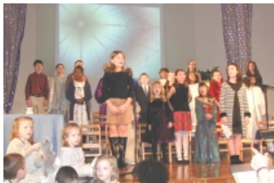
Children's Musical, Light of the World, December 21, 2003