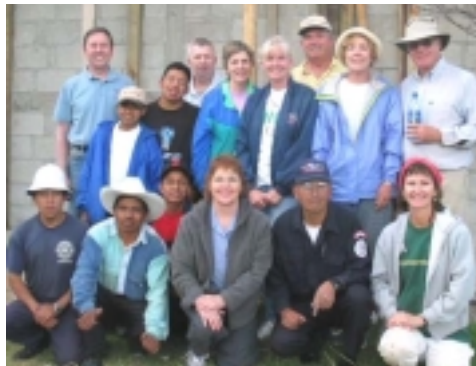
2003 Guatemala work team