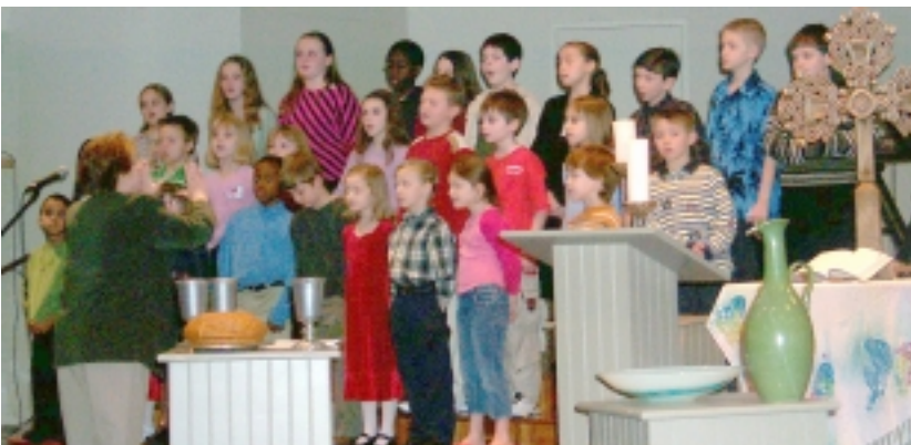
Children's choir sings in Common Ground service on Children's Sabbath