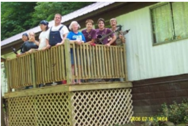
Our work crew on the finished product