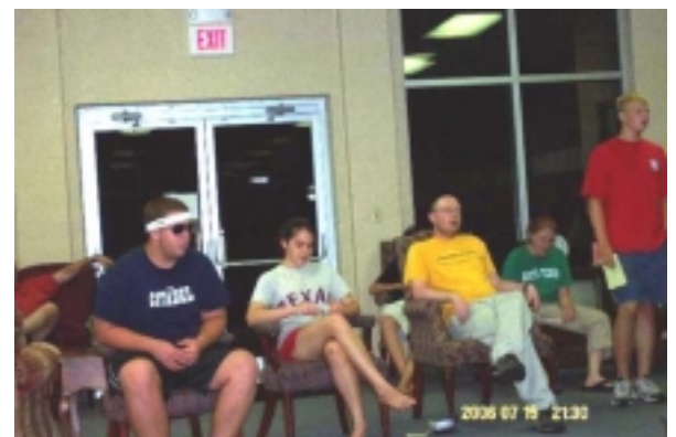
Last night before driving into Dallas on Sunday