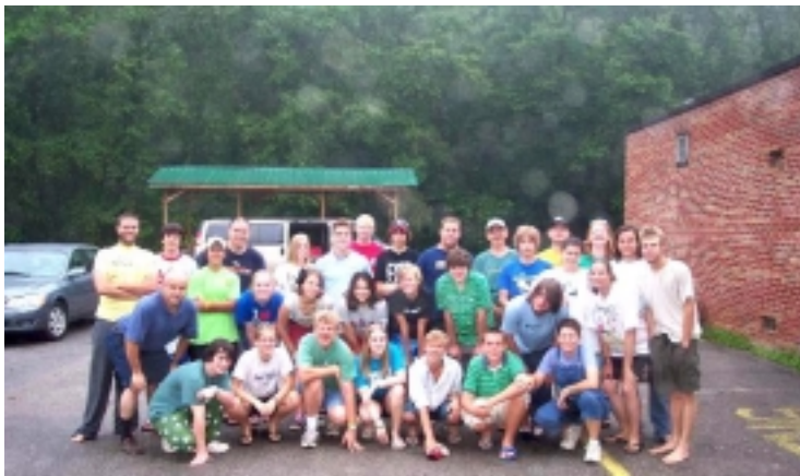
Before pulling out from the ASP center to return home on Saturday