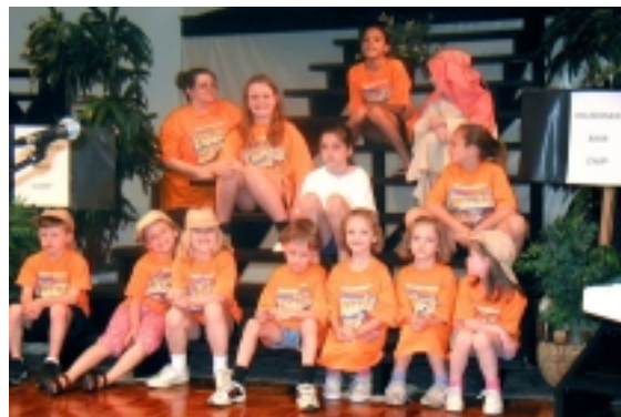
Cast members take a break during the dress rehearsal