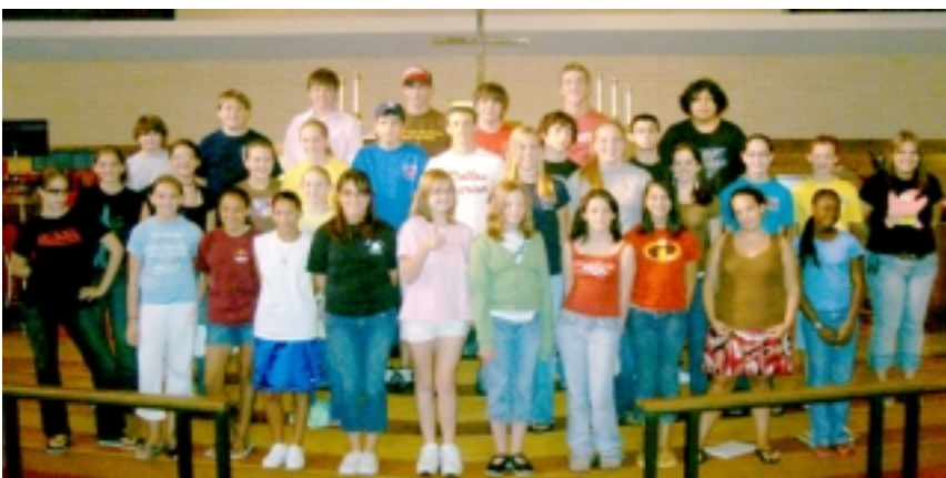
...and Youth Singers!