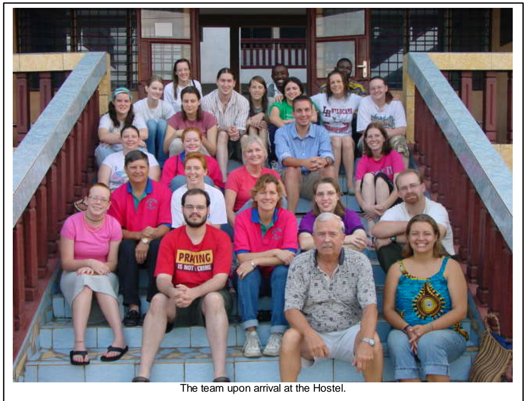
The team upon arrival at the Hostel.

Although one of the suitcases looked like it had been run over by a truck, the contents of all the bags were intact.