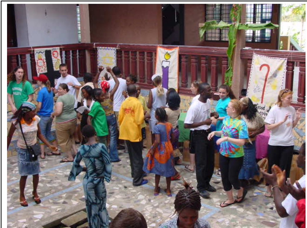
Singing and dancing in the courtyard (This happened a LOT!)