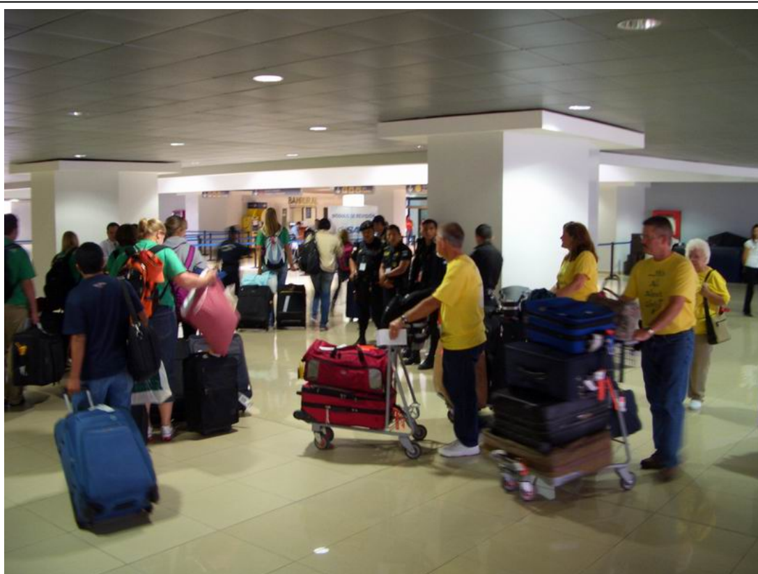
Greeting old friends and new friends at the Guatemala airport as we wait for the bus.